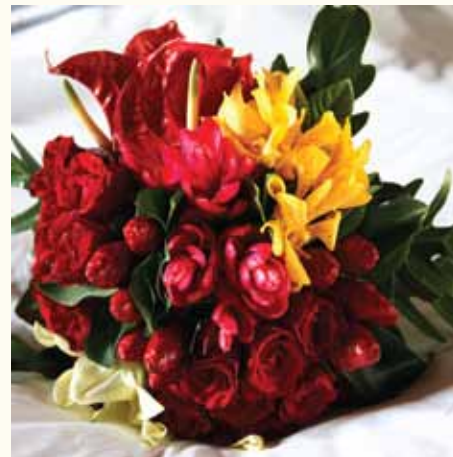
Flowers for Family and Friends