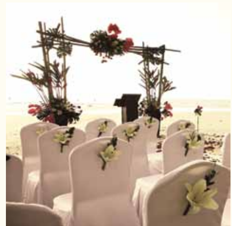
Deluxe Wedding Bower