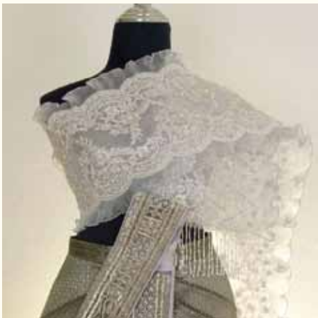
Ladies in Traditional Thai Dresses